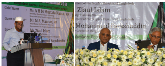
Inaugural Session of BIDS Critical Conversations 2017