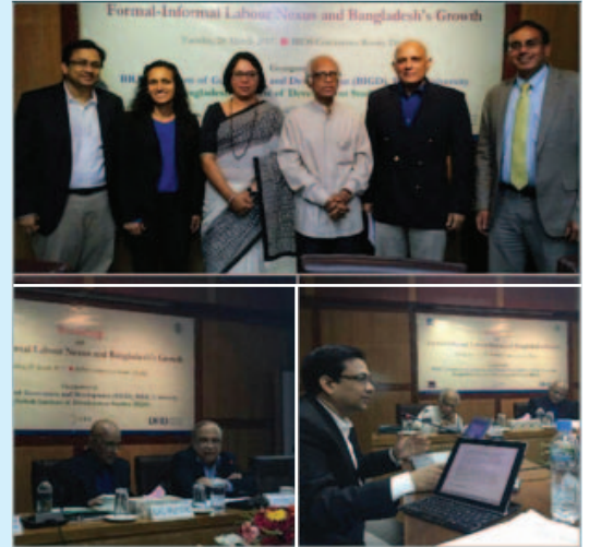
Workshop on Formal-Informal Labour Nexus and Bangladesh's Growth