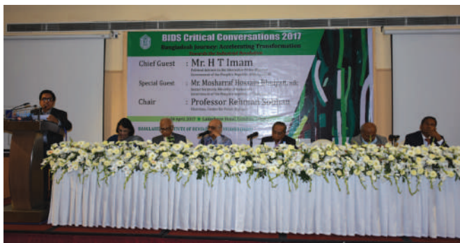
Concluding Session of BIDS Critical Conversations 2017