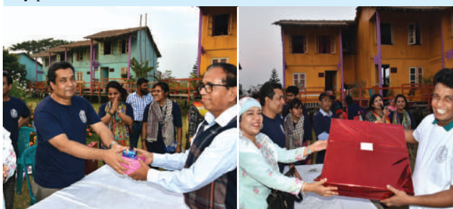
BIDS Annual Picnic: Some Joyful Moments

BIDS arranged its annual picnic event of 2017 on 4 February for the staff and their families. The picnic spot was Padma Resort in Louhaganj. The whole day passed with fun and fervour. There were enjoyable activities like cricket tournament, a football tournament and various other games for the staff, their spouses and children. The day ended with a cultural programme, followed by prize distribution to the winners and raffle draw.