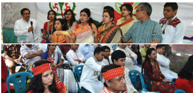
Cultural Event and a Section of the Audience