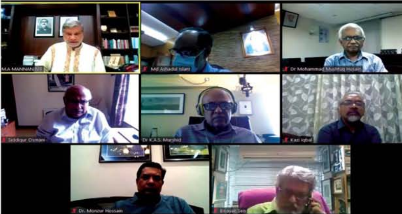
Webinar Critical Conversations 2020

BIDS Critical Conversations 2020 this year took the shape of a webinar and was held on 24 June 2020. BIDS researchers highlighted their work focusing on core areas of Covid impact, namely effect on unemployment, especially in the SME/MSME sector, the consequences for poverty and a more general assessment of Covid responses and effects in terms of adjustments in social behaviour, state of Covid-related knowledge, and the distribution of Covid-like symptoms across space and by socioeconomic and demographic categories pertaining to a more generalised population distribution. In all cases, policy insights and advice were extracted to suggest possible future directions for the fight ahead.